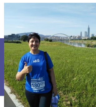
12 RUN FOR LIFE, RUN FOR IBD 1.6KM

We couldn't achieve all these without the invaluable contributions of our expert volunteers, thank you!