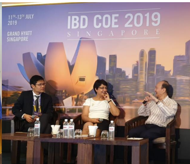
2 IBD CENTRE FOR EXCELLENCE CONFERENCE