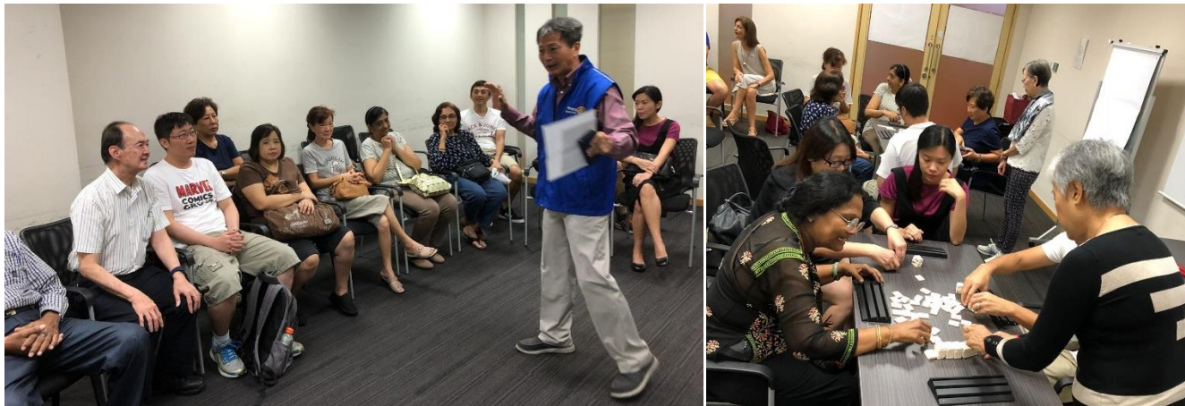
9 MENTAL WELLNESS WORKSHOP BY ROTARY CLUB OF BUKIT TIMAH: A SESSION OF 'RUMMIKUB'