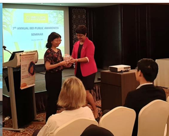
3 SEVENTH ANNUAL IBD PUBLIC AWARENESS SEMINAR MAY 2019