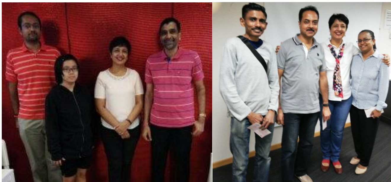
10 IBD MONITORING FUND BENEFICIARIES