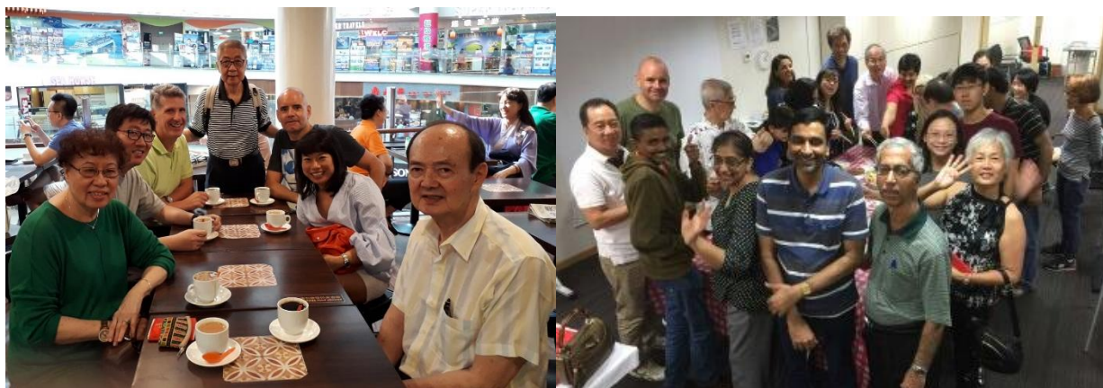
7 EXCELLENT FELLOWSHIP AMONGST MEMBERS