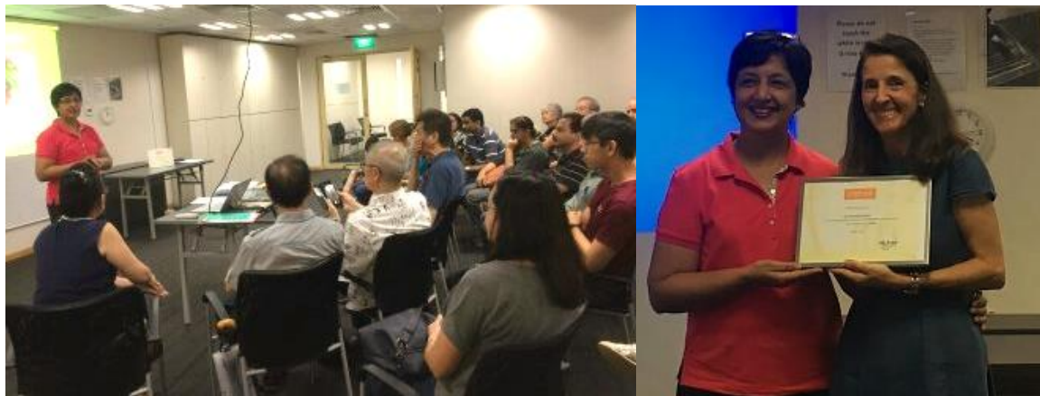
6 MEMBERS LOOKING FORWARD TO A TALK ON SPECIFIC CARBOHYDRATE DIET