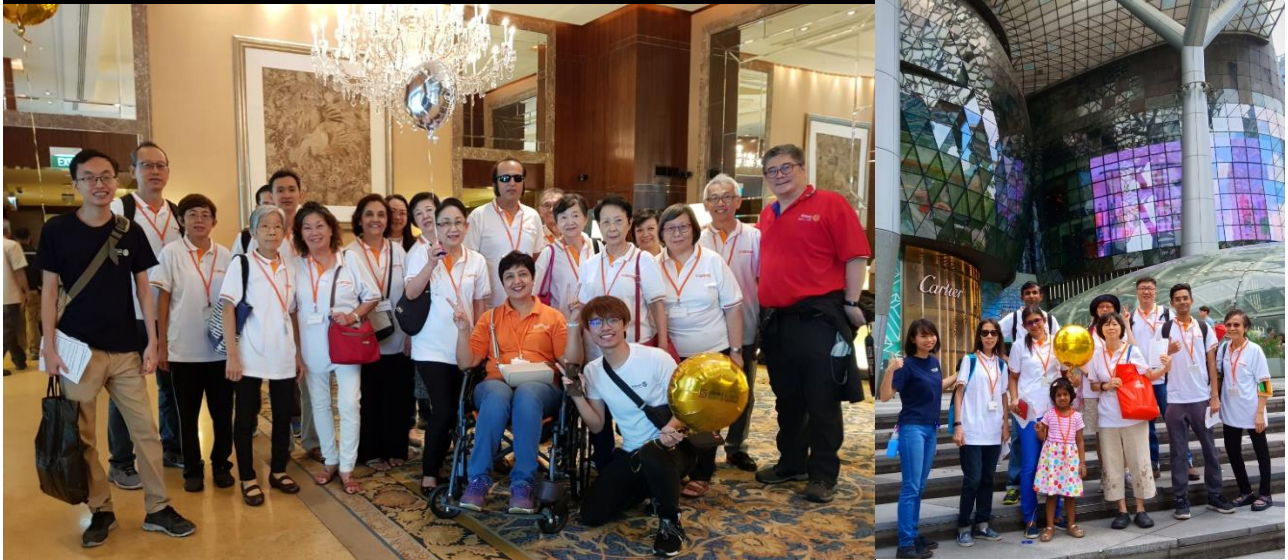
5 IBD PUBLIC AWARENESS WALK ON ORCHARD ROAD MAY 2019