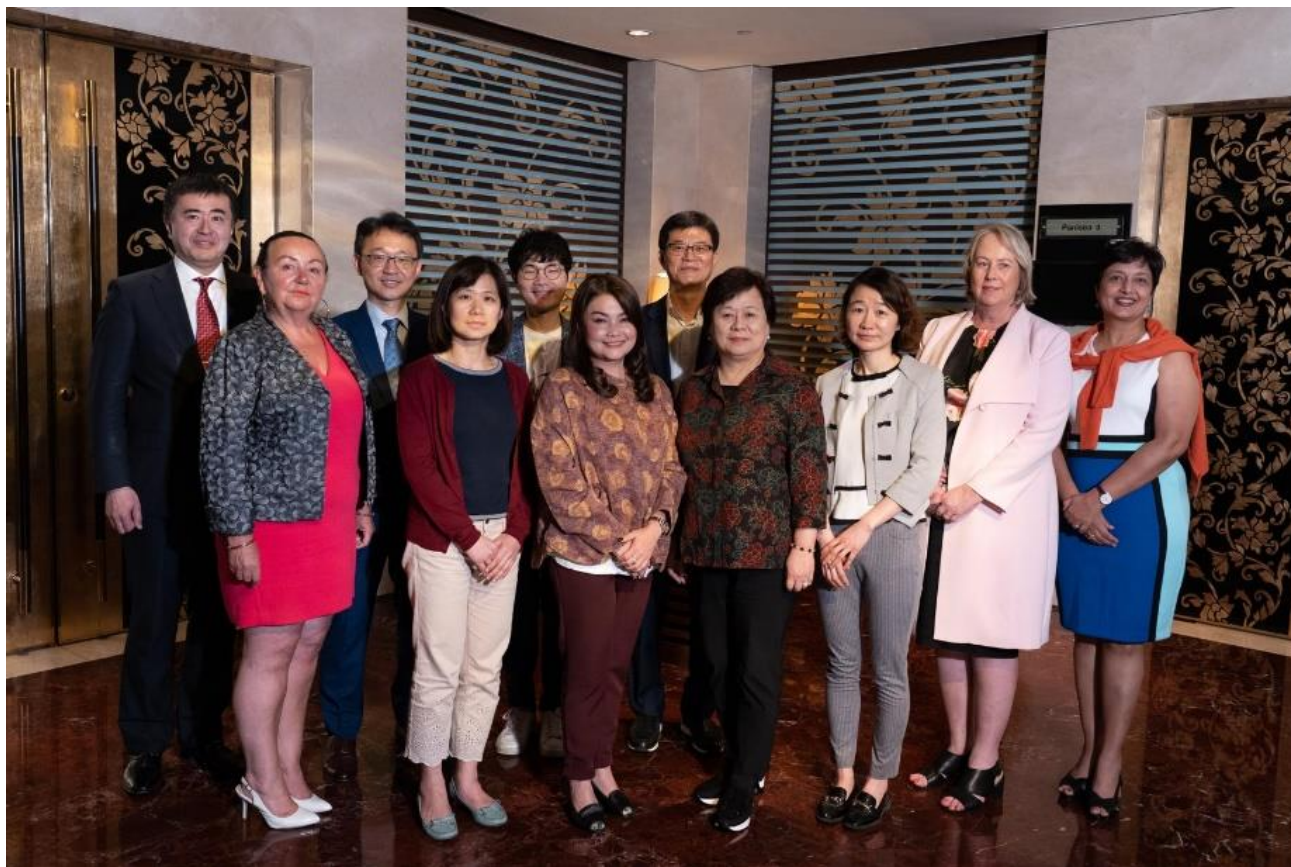
11 SECOND ASIA-PACIFIC IBD ALLIANCE MEETING IN BANGKOK 2019