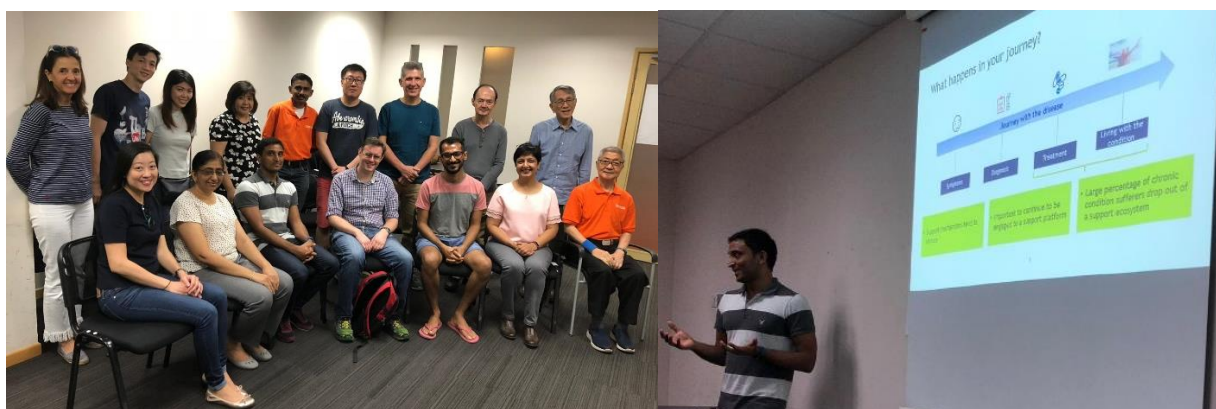
8 FOCUS GROUP DISCUSSION ON AN APP FOR IBD PATIENTS