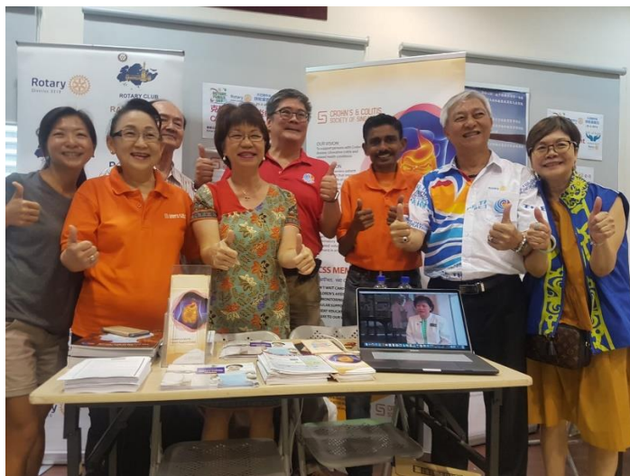
1 CCSS BOOTH @ROTARY FAMILY DAY 2019